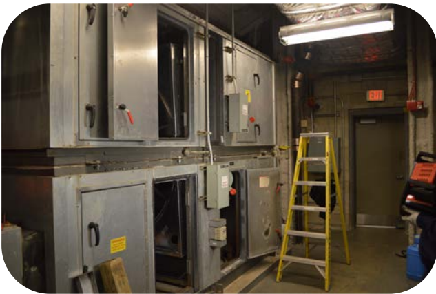
Airxchange segmented wheel resolves AHU access restrictions without compromising the cabinet structure.

Wentworth's replacement wheel from Airxchange was efficiently assembled in less than a day, economically restoring the energy saving benefit to the air handling system.