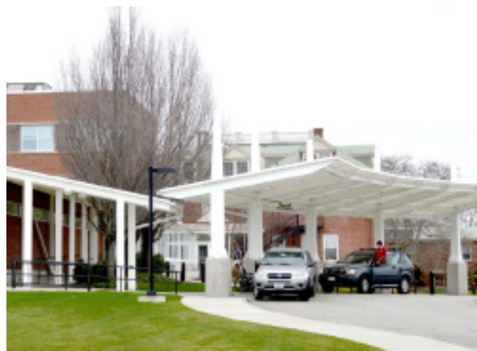
Anna Jaques Hospital is a 24-hour in-patient facility.