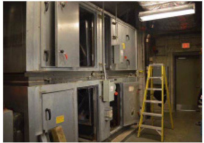
Airxchange segmented wheel resolves AHU restrictions without compromising the cabinet structure.

- Zone Mechanical, HVAC Service contractor of WIT