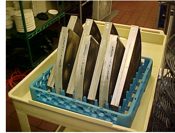
Airxchange energy transfer media ready for dishwasher cleaning.

However, soaking the media overnight, which is only possible with a segmented wheel, proves to be far more effective. Airxchange tests indicate that an overnight soaking restores performance to 90-95% of new.